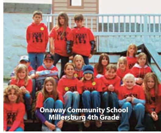
Onoway Community School Millersburg 4th Grade