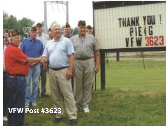
VFW Post #3623